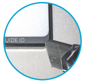
Front label (01)